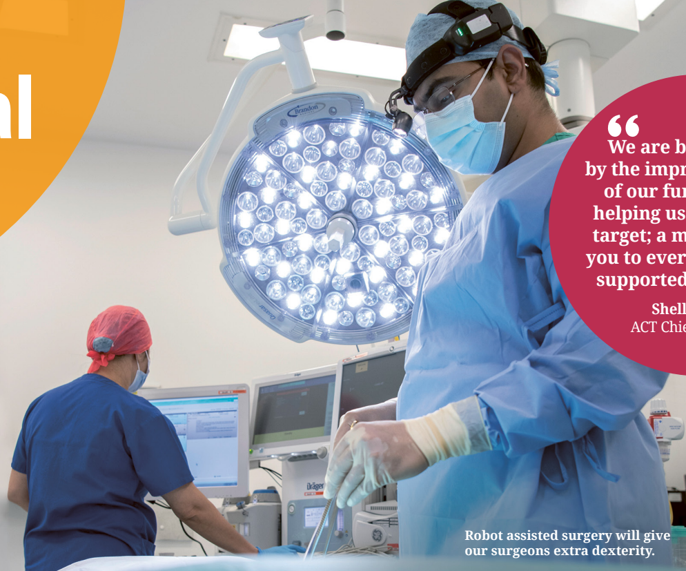
Robot assisted surgery will give our surgeons extra dexterity.

In 2021 we asked you, our supporters, along with the communities in and around Cambridge to help buy Addenbrooke's a new surgical robot. You stepped up in your thousands, and we're thrilled to announce that we've reached our £1.5 million target!